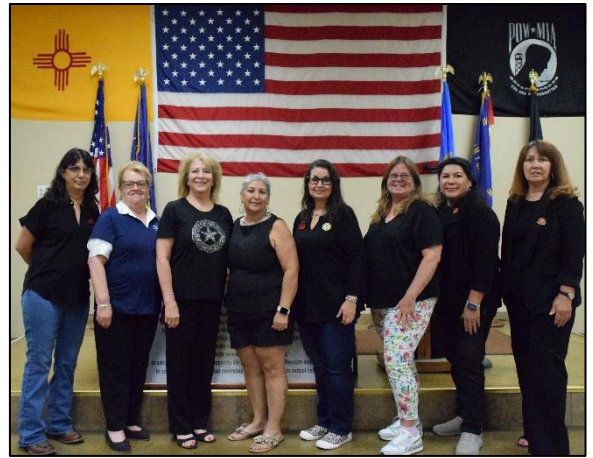
POST 69 AUXILIARY OFFICERS