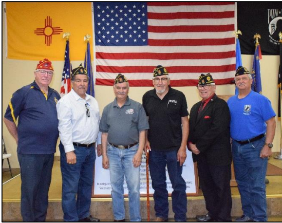
POST 69 LEGION OFFICERS