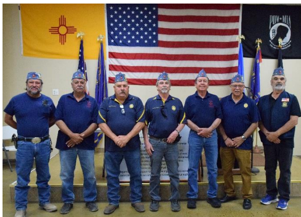
SQUADRON 69 OFFICERS