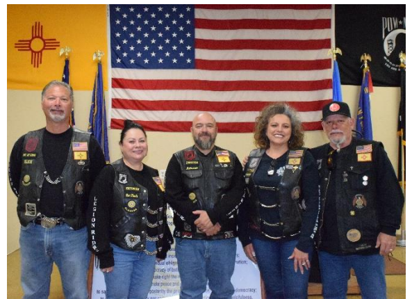
CHAPTER 10 OFFICERS